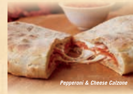
Pepperoni & Cheese Calzone