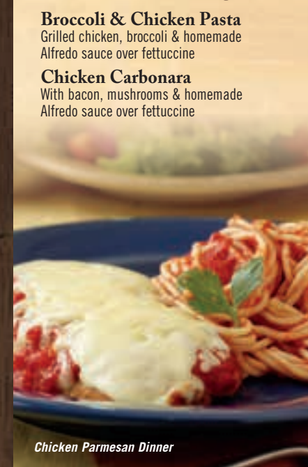
Chicken Parmesan Dinner

With garlic sauce, grilled chicken, artichoke hearts, spinach, roasted red peppers & fettuccine